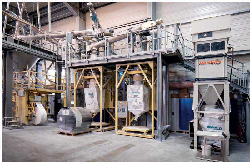
Fig. 1 Highly efficient and reliable dust filtration systems are becoming increasingly important, especially in the wake of the fine dust debate

Especially the fineness of the generated mineral dusts as well as their abrasive properties place high demands on traditional filter systems with depth filtration media such as cartridges, bags and hoses. These conventional systems can prove inefficient as fine particles irreversibly penetrate into the depths of flexible, woven or needle felt filter media and clog them. This typically leads to unstable operating conditions and insufficient air flows. In addition, such media wear out quickly due to the abrasive nature of mineral particles. This can result in