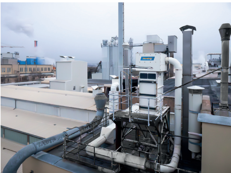
Fig. 3 The high efficiency of dust separation and the associated low dust emissions, as well as the fact that they are to a large extent maintenance-free are the reasons why Nabaltec uses over 50 Herding filter systems

In addition, retrofit solutions from Herding offer the attractive option of upgrading existing systems to the state of the art and thus optimising work and process safety.