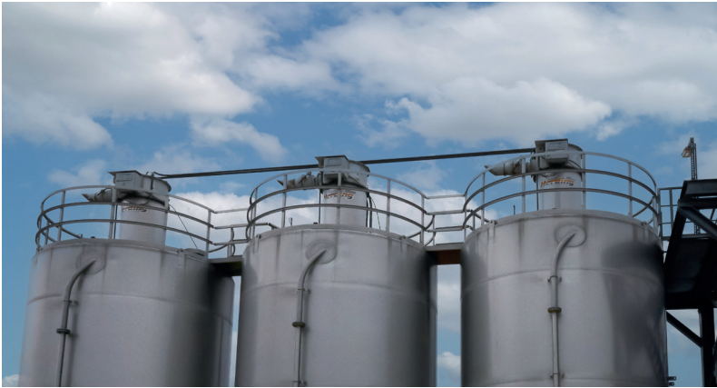
Fig. 2 For more than 20 years, Nabaltec has relied on safe, efficient and sustainable filtration technology from Herding

It is therefore necessary to use filter systems adapted to the individual application including efficient capture of emissions directly at the point where they are generated. The capturing devices should be designed according to the latest findings in flow mechanics.